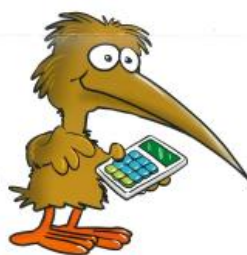
Kiwi Maths Competition