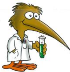
Kiwi Science Competition

Ask your teacher for details and entry form.